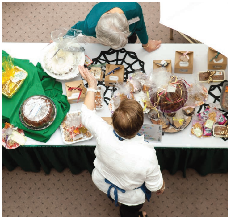
ASWO members make homemade, from-scratch baked goods for sale at the Hearts and Hands Bazaar. Who can resist?