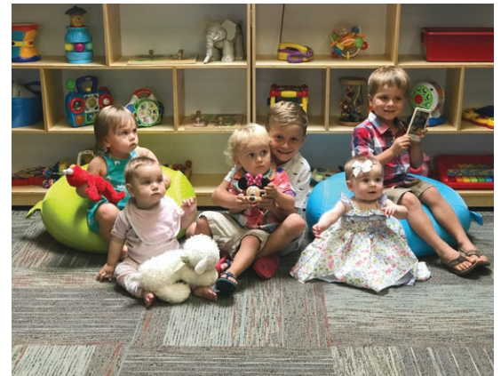
The Parish Nursery — a safe place where our children can play and learn about Jesus while their parents enjoy the sacrifice of the Mass free of distractions