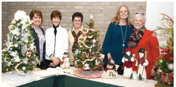
Circles in the ASWO decorate small artificial trees with donated ornaments for the Hearts and Hands Bazaar. The trees are sold in a silent auction.